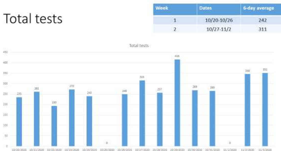
Table 4: Total # Tests Conducted at All Sites- October 20 - November 02, 2020