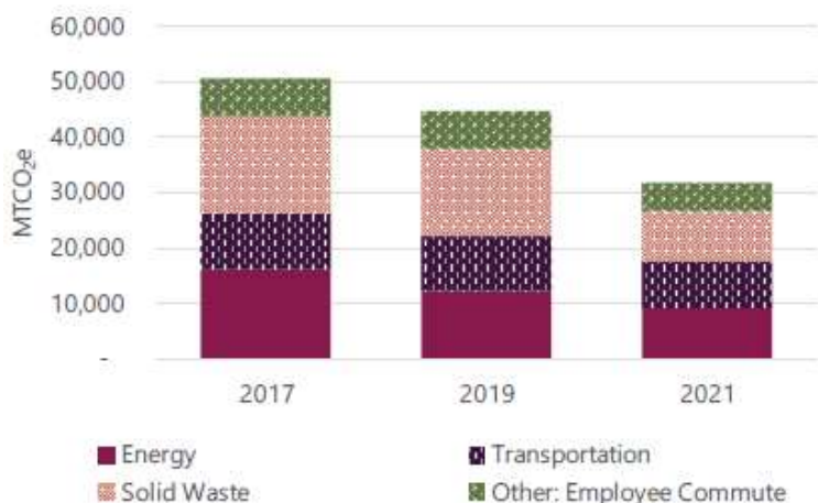
Figure 1: Municipal GHG Emissions by Source for 2017, 2019, and 2021

Many factors can affect operational emissions.