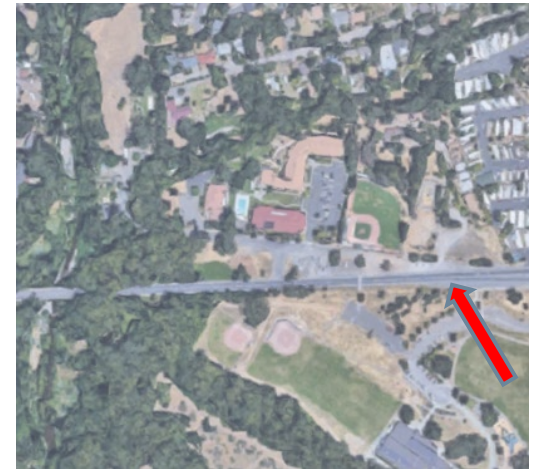
View reference site plan