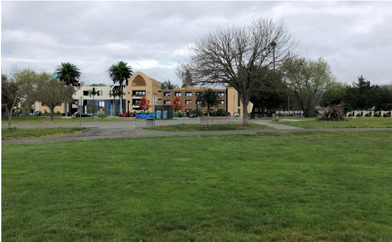
Simulation from Maxwell Farms Regional Park