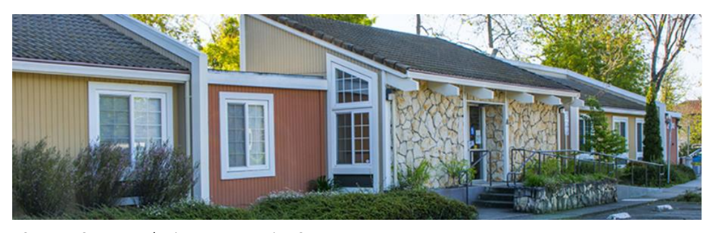
Sonoma County Probation Day Reporting Center