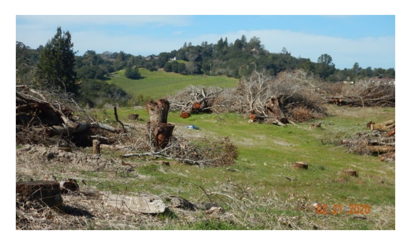
Same property on county approved tree removal-mostly native oaks