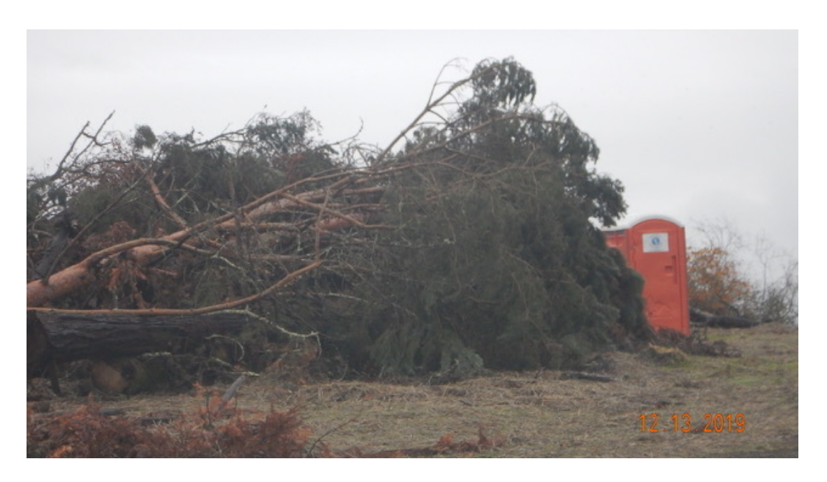
County approved tree removal on property near Laguna de Santa Rosa

What we are seeing today is unfit for Sonoma County. Without your leadership, these tragedies will continue. We urge the Sonoma County Board of Supervisors to step up, be a true leader in the state, and protect the county's unprotected biologically and globally important woodlands now.