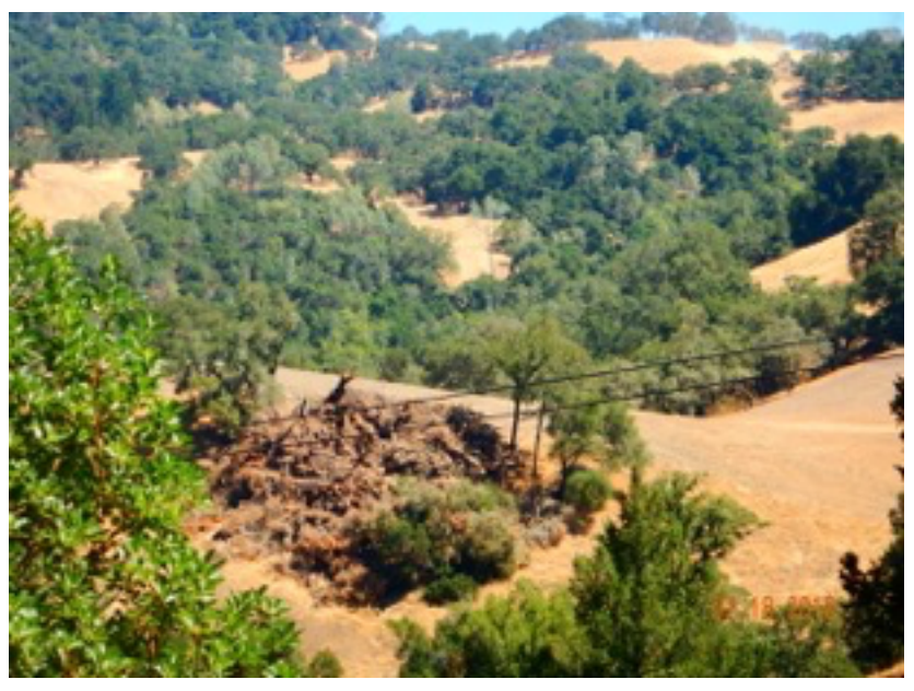
Beginning of Ken Wilson project clearing about 200 acres of oaks for wine grapes

We seek immediate Board action to stop the destruction of climate-serving-woodlands until such time as a science driven twenty-first century Tree Protection Ordinance has been adopted by Sonoma County. We request an urgency interim ordinance adopting a moratorium on woodland tree removal and other damaging activities until said Ordinance is in place.