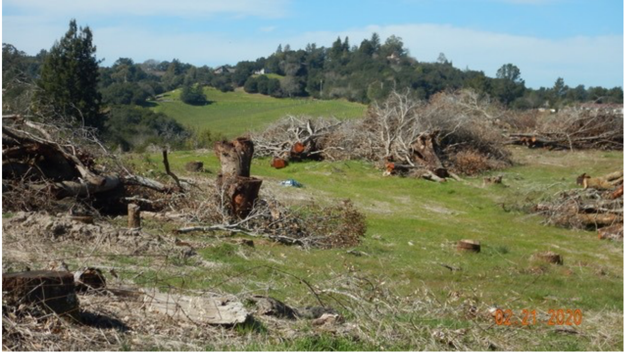
Same property on county approved tree removal—mostly native oaks