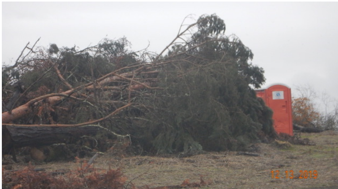
County approved tree removal on property near Laguna de Santa Rosa

What we are seeing today is unfit for Sonoma County. Without your leadership, these tragedies will continue. We urge the Sonoma County Board of Supervisors to step up, be a true leader in the state, and protect the county's unprotected biologically and globally important woodlands now.