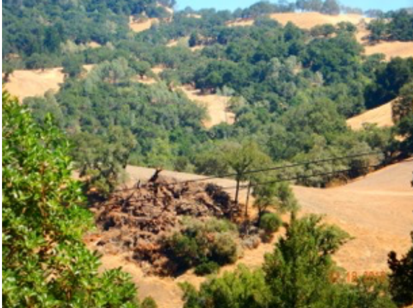
Beginning of Ken Wilson project clearing about 200 acres of oaks for wine grapes

We seek immediate Board action to stop the destruction of climate-serving-woodlands until such time as a science driven twenty-first century Tree Protection Ordinance has been adopted by Sonoma County. We request an urgency interim ordinance adopting a moratorium on woodland tree removal and other damaging activities until said Ordinance is in place.