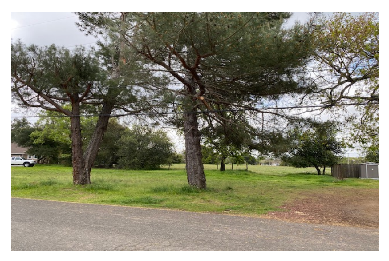
Donald Street vacant 2-acre lot