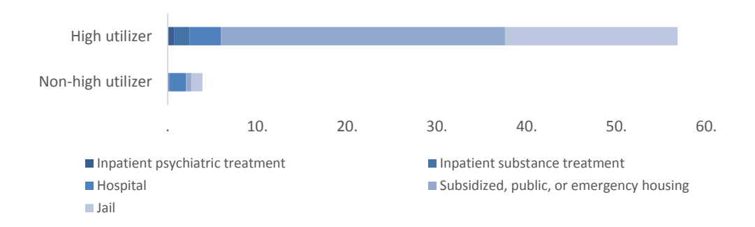
Figure 1) Average service days per year by utilization group.

Consistent with the high utilization of services in general, the study found that these high utilizers also had over ten times the incidence of relapse, re-admission, and recidivism. For example: