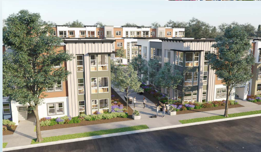
West College Development Project