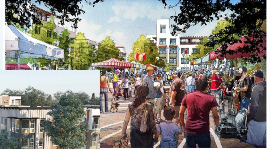
Roseland Village Development Project