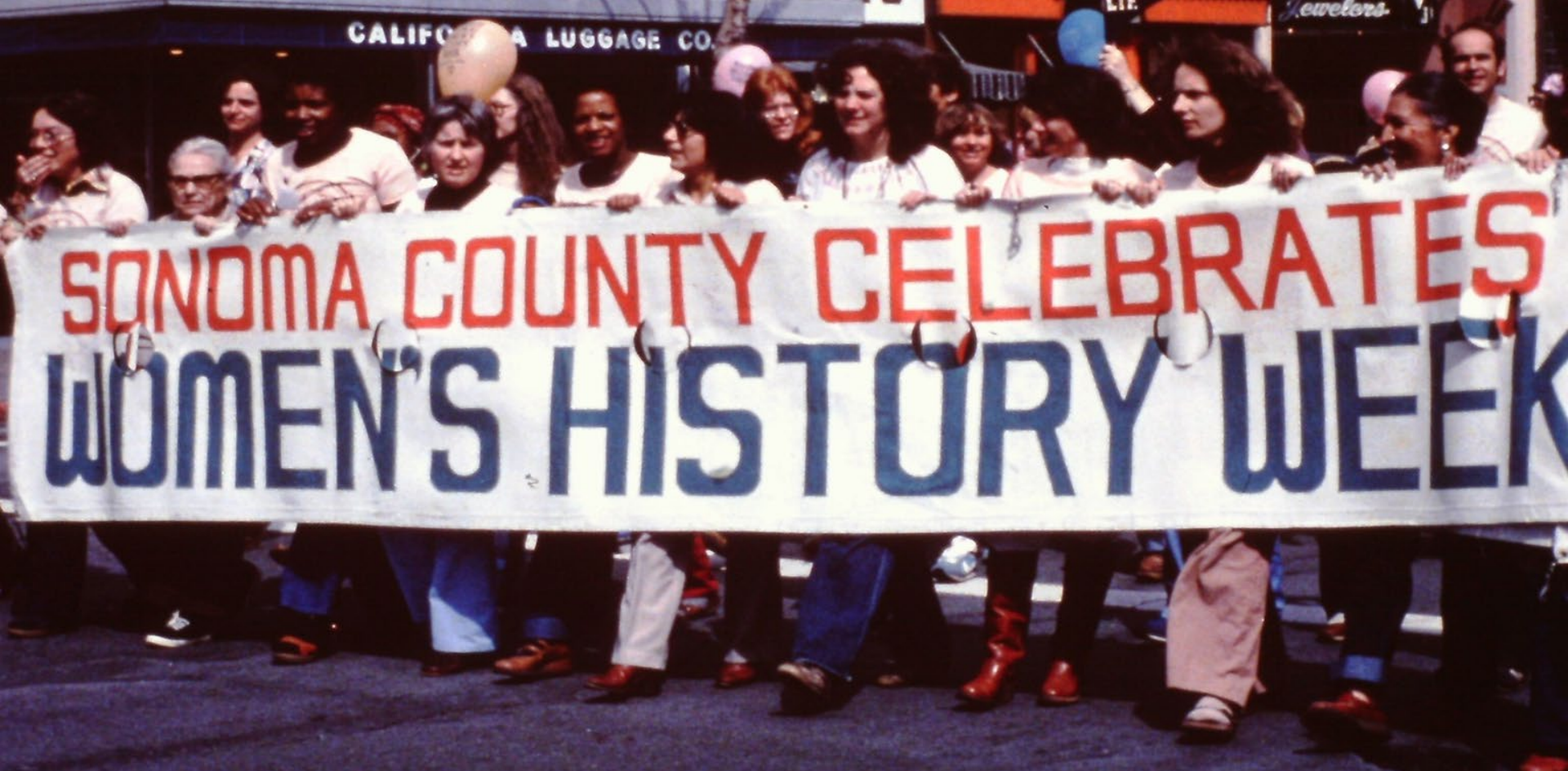
Sonoma County Commission on the Status of Women 4 th Street , March 1978