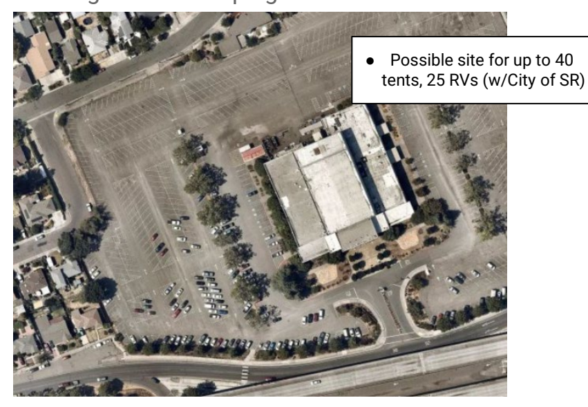
Vets Memorial Building Parking Lot 1351 Maple Avenue, Santa Rosa