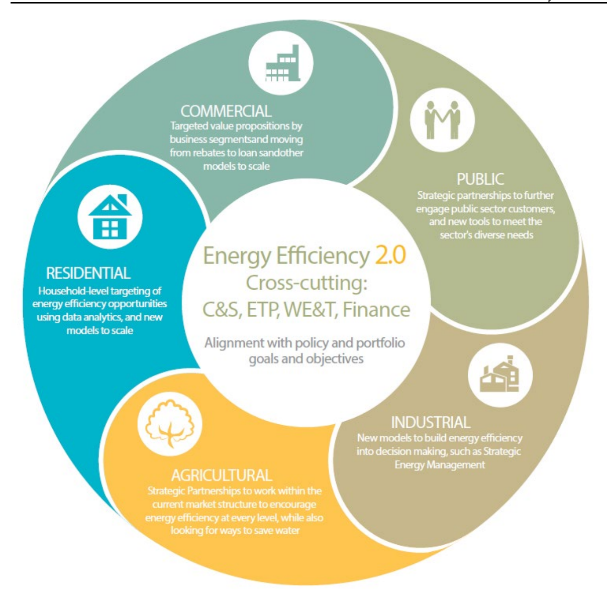
Figure 1.2 - PG&E's EE Revised Portfolio Focus Areas.

As PG&E transitions to a fully 3P Implementer supported EE portfolio that includes 3P EE Programs and Local Government Partnership (LGP) Programs, PG&E's role will evolve to that of a Portfolio Administrator (PA), and the role of 3P Implementers implementing LGP Programs will also evolve beyond the scope observed today. Figure 1.3 – 3P Implementer Roles in EE Programs that include LGP Programs provides a simple depiction of these changing roles for both PG&E and 3P EE Implementers.