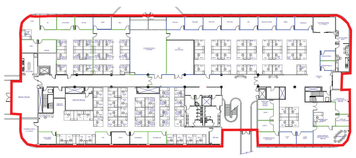
EXHIBIT A-1 Premises (Premises outlined in red)

2<sup>nd</sup> Floor Plan (not to scale)