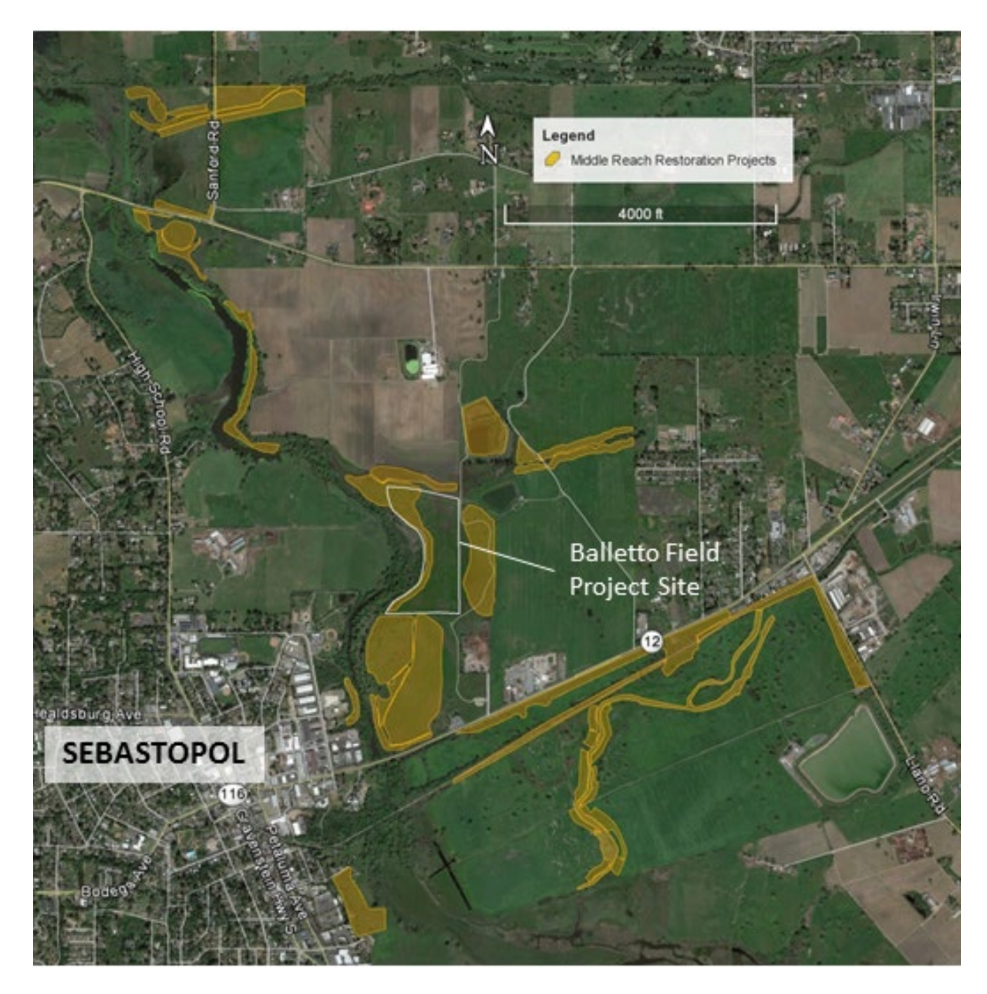
Exhibit A: Site Maps

Map 1: Laguna de Santa Rosa Trail Balletto Field Vernal Pool Project Area Location