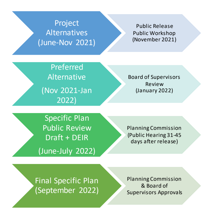
Figure 2. Process Roadmap

The below graphic illustrates the anticipated timeline at a glance and key milestones for the effort.