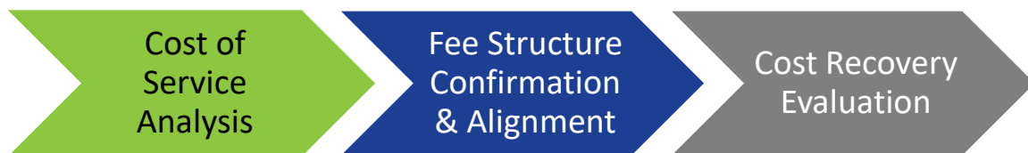
Table 2. Primary Components of a Fee Study

The following represents the three phases of analysis completed for each County department, division or section studied: