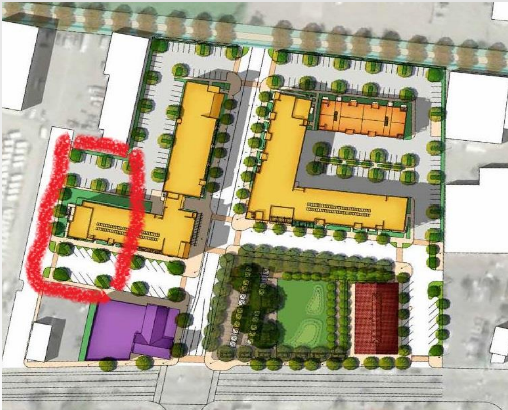
Arial View—Roseland Site