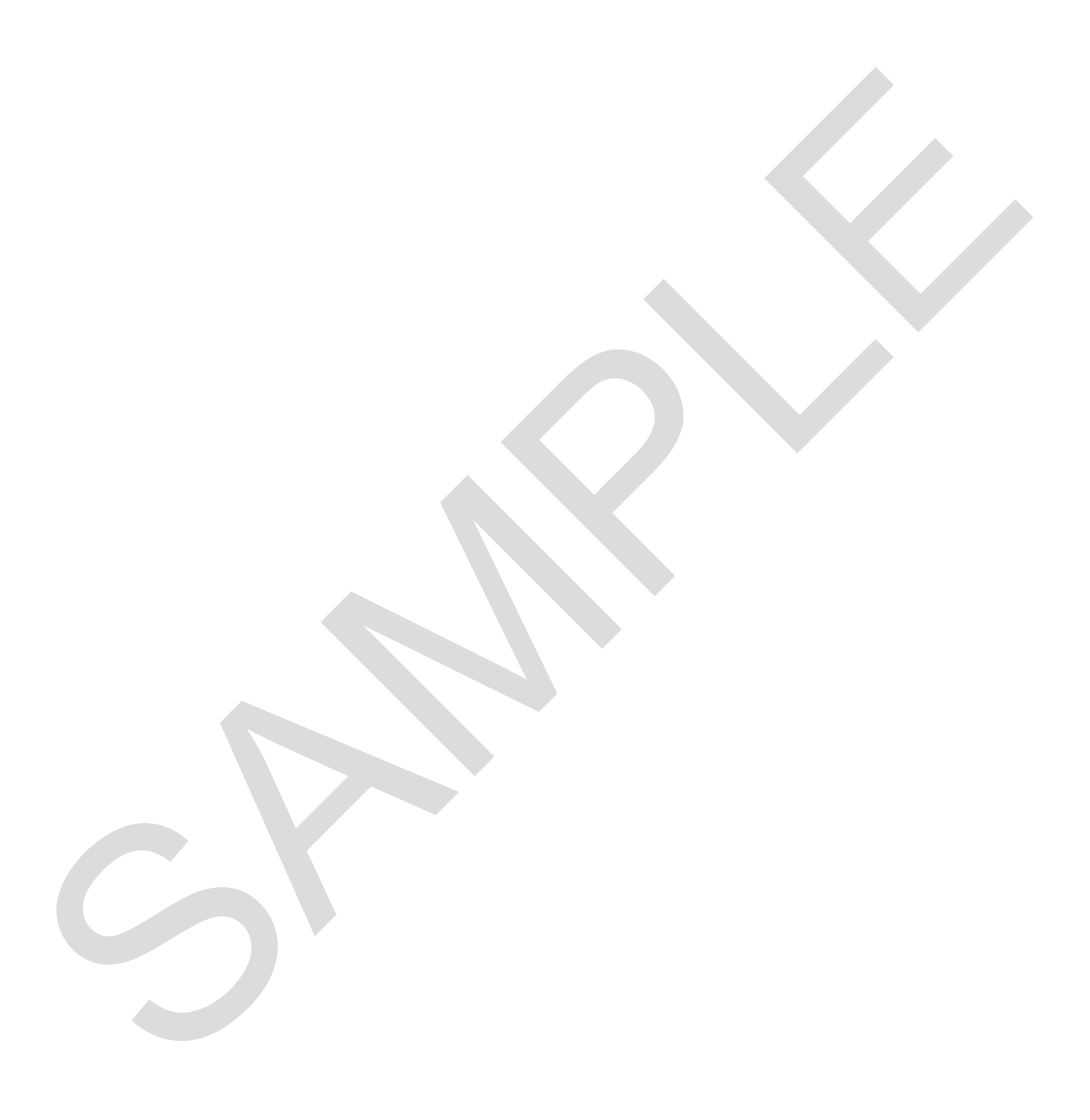
Exhibit A-3. Program Requirements