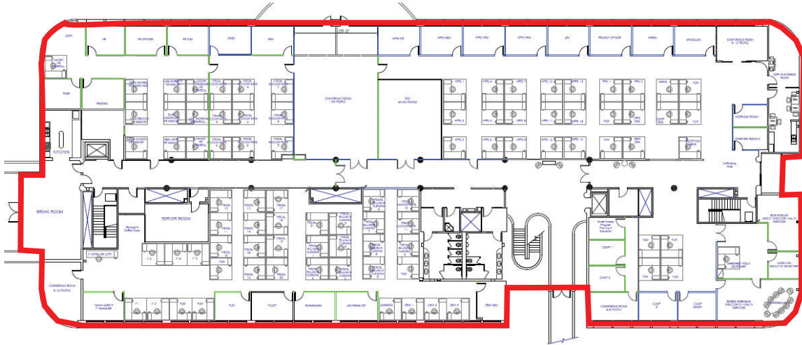
2 nd Floor Plan (not to scale)