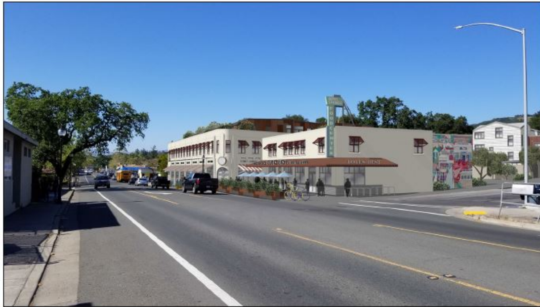
Exhibit B: Visual Simulation Viewpoint 1 - Northbound Highway 12 (Before & After)