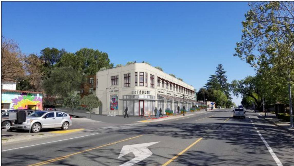
Exhibit D: Visual Simulation Viewpoint 3 - Southbound Highway 12 (Before & After)