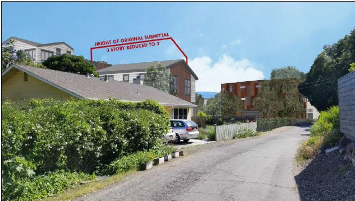
Exhibit E (REVISED): Visual Simulation Viewpoint 4 - Westbound Arroyo Road (Before & After)