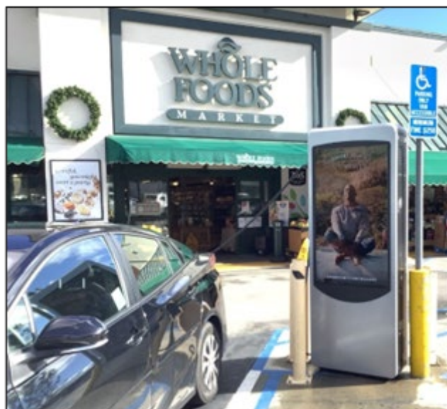
Sonoma County Tourism advertising on Volta charging station at a Whole Foods in Southern California

SCT is working with a new-to-us advertising partner – Volta. This partnership places Sonoma County advertising on electric vehicle charging stations throughout Southern California – a key target market for SCT. An example of this is shown below.