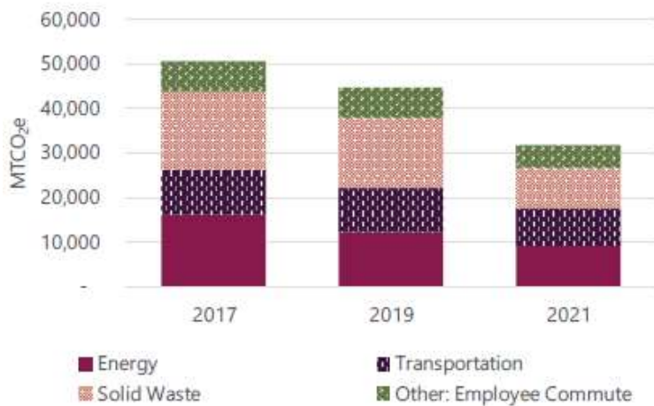
Figure 1: Municipal GHG Emissions by Source for 2017, 2019, and 2021

Many factors can affect operational emissions.