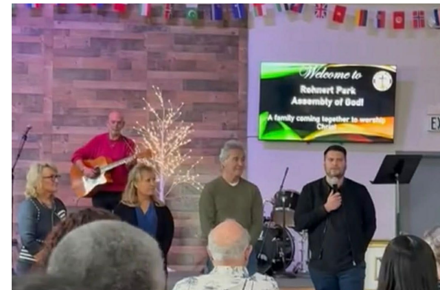
ROV Staff townhall meeting at Assembly of God assisting voters in Spanish.