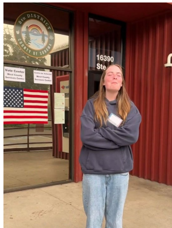
Vote Center Staff announcing the Polls are Now Open at Our Guerneville Vote Center